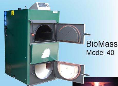
BioMass Model 40