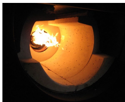
Oil Burner (bottom chamber)