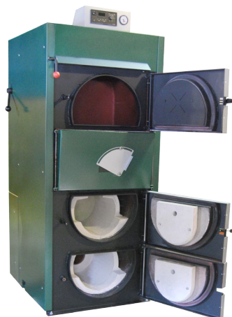
BioMass Combo (Wood-Oil-Gas) Models 25kW, 40kW, 60kW

During the gasification process, wood inside the loading/burning chamber is dried and gasified. The gas (smoke) produced is drawn down through the ceramic nozzle into the ceramic-lined gasification chamber with a blower, and burned at very high temperatures. The hot, burned gas travels up through the heat exchanger tubes, out the exhaust opening and into the chimney. The heat of gasification (around 2000 °F) completely burns off virtually all smoke and particles. Gasses released from the chimney are practically invisible and do not contain unburned particles.