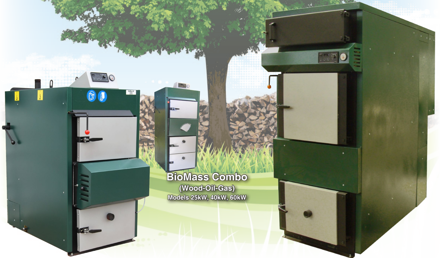
BioMass Combo (Wood-Oil-Gas) Models 25kW, 40kW, 60kW

Models 25 kW, 40 kW, 60 kW, 80 kW and 100 kW